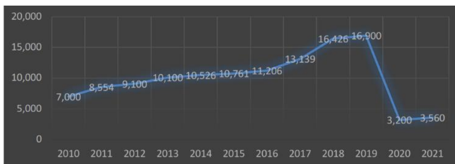
Figure 1. Total Foreign Exchange of the Tourism Sector in Indonesia in 2010-2021 (Billion US $)

Source: BPS, 2022. Total Foreign Exchange of the Tourism Sector (Billion US $).